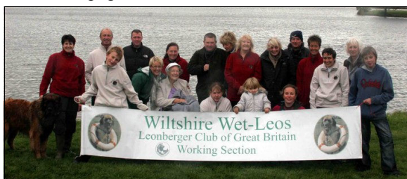
Taken in 2010